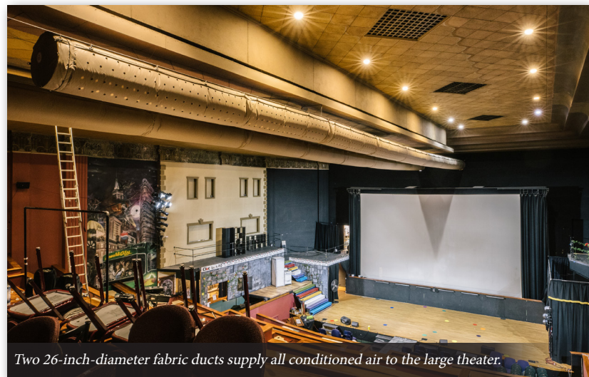
Two 26-inch-diameter fabric ducts supply all conditioned air to the large theater.

"We began looking for a solution in 2017," said Melcher. "We understood that seeking a grant from the state of Pennsylvania would take considerable time. What we didn't anticipate was how dramatically a new HVAC system would impact the use of the theater or our capacity to operate a business here. What transpired has been an absolute game changer."