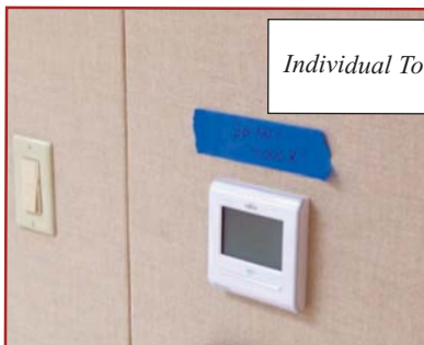
Individual Touch Panel Controller