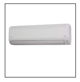
(1) ASU 36RLXB