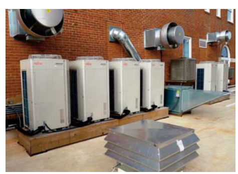
The outdoor units were installed on the upper roof and on various lower roofs. Mostly 6-ton outdoor units were used.