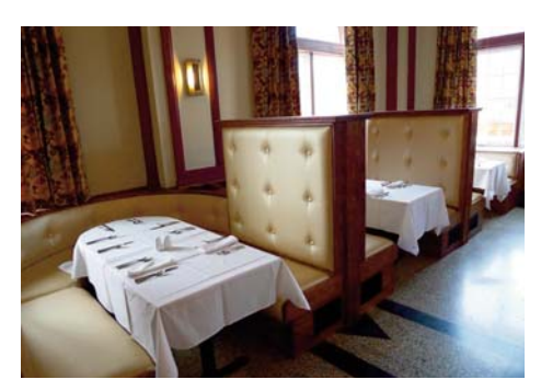
Slim duct units are installed underneath bench seating in the restaurant.

could not be happier with the results of the renovation.