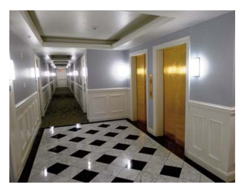
Guest room corridors are served by a slim duct unit at both ends. They are installed with an Auto Louver Grille Kit and a large filter grill to provide filtration and service access.

The historic nature of the building provided many challenges to the designers of the Robert E. Lee Hotel. The building did not have an existing HVAC system except