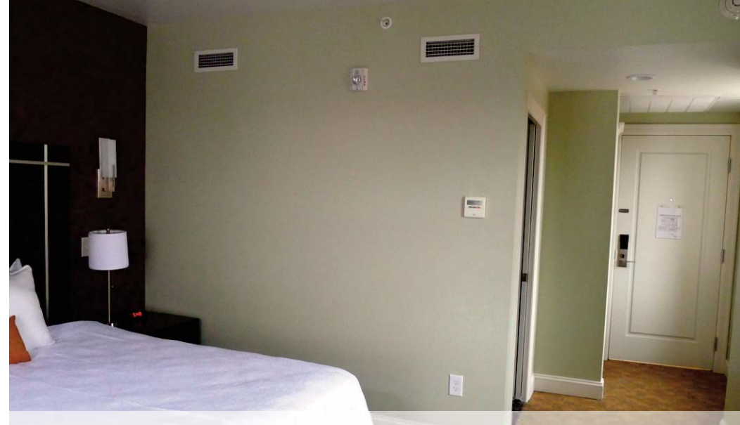
Guest rooms are served by slim duct units above the entryway ceiling and using small stretches of ductwork