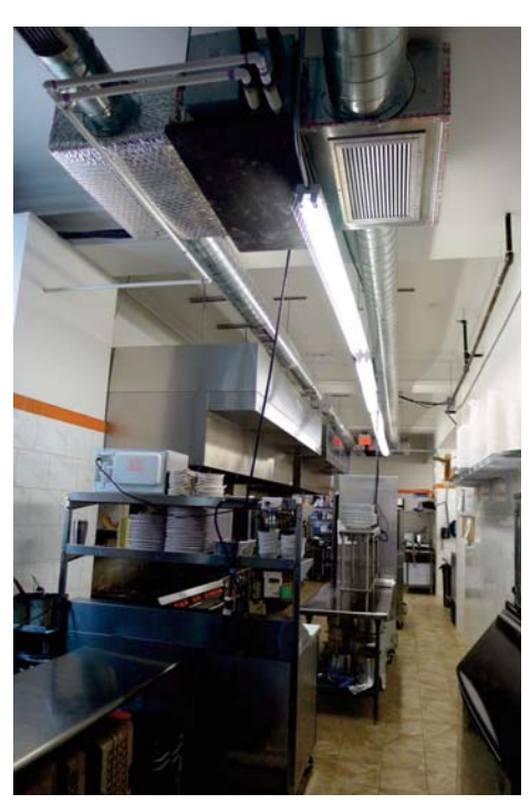
The kitchen is served by two high static ducted units and significant quantities of makeup air.