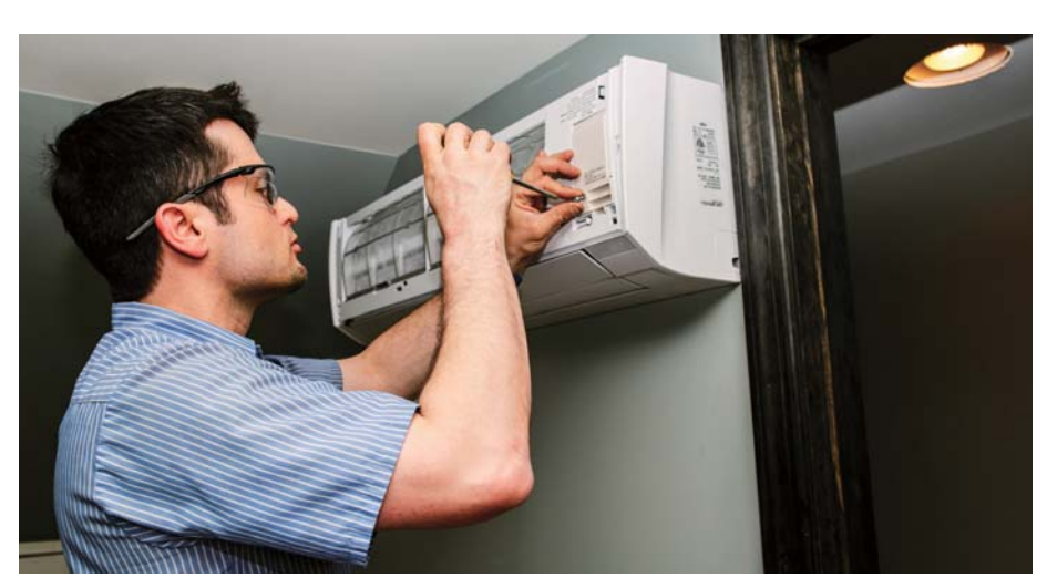
7,000 BTUH wall-hung evaporators were used in the upstairs bedrooms of the new in-law suite.

On the flip side, more young adults are moving back in with parents. This may be an indicator of rising student debt, the unavailability of high-paying jobs available to new graduates unwilling to move