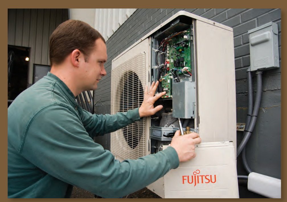
A Fujitsu highefficiency condensing unit is installed at Cornerstone Church, California, MD. The Fujitsu mini-split systems were paired with a 15-ton Modine Atherion unit, offering ERV-conditioned fresh air, AC, and heating capabilities.