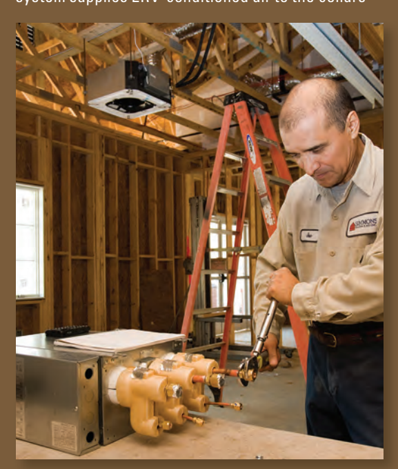
A technician prepares refrigerant lines for a ceiling cassette in the addition at Cornerstone Church, California, MD.

At Cornerstone, the packaged ventilation system supplies ERV-conditioned air to the collars