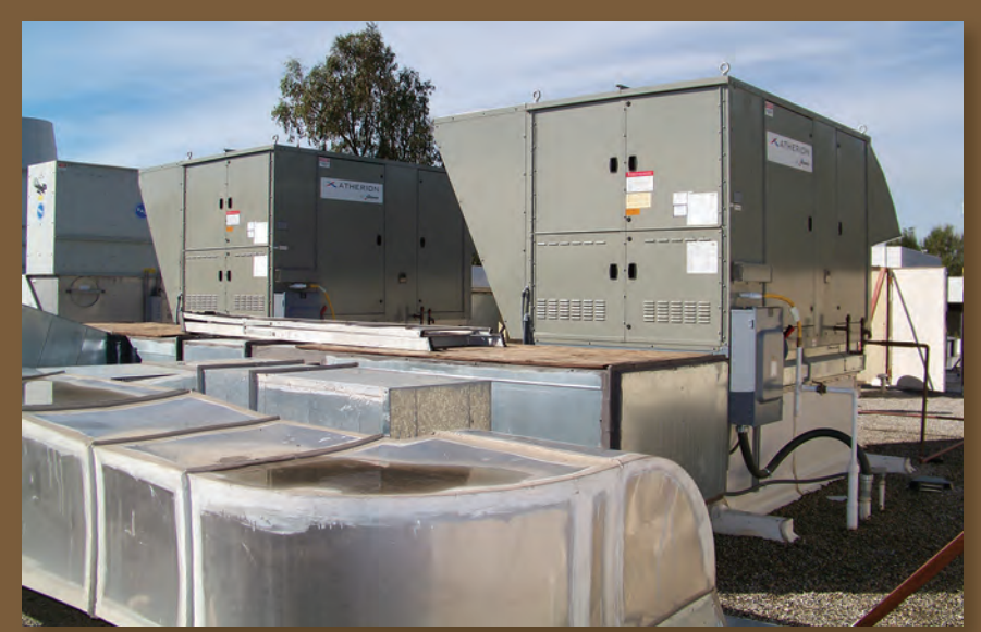
Modine's Atherion commercial packaged-ventilation system, a 100% dedicated outside-air systemwith an integrated energy-recovery ventilation (ERV) module, was installed at Rite Engineering, Franksville, WI, to improve temperature and air quality for the machine shop.

This time, Henning expanded the facility by 6,000 sq. ft. and ordered a new 30-ton Atherion rooftop system. Together, the mechanical systems keep the air clean and properly conditioned.