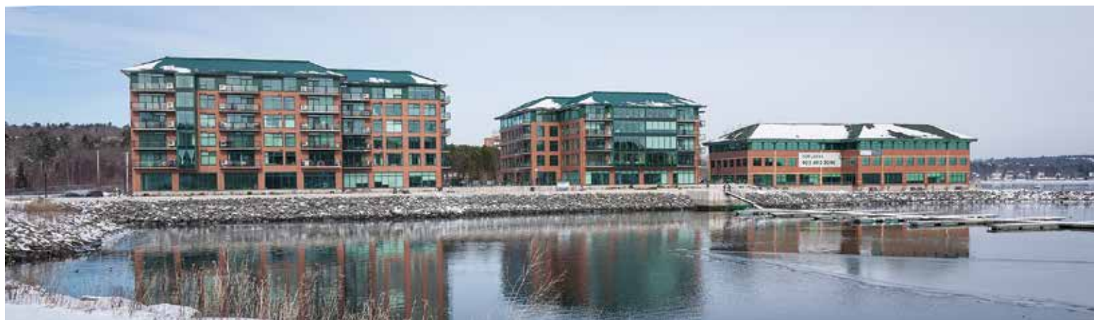
Provident Developments' Dockside Waterfront Drive features 78 luxury condos in two towers in Bedford, Nova Scotia, Canada.

Comeau Refrigeration has a local reputation for making ductless systems work, despite the weather.