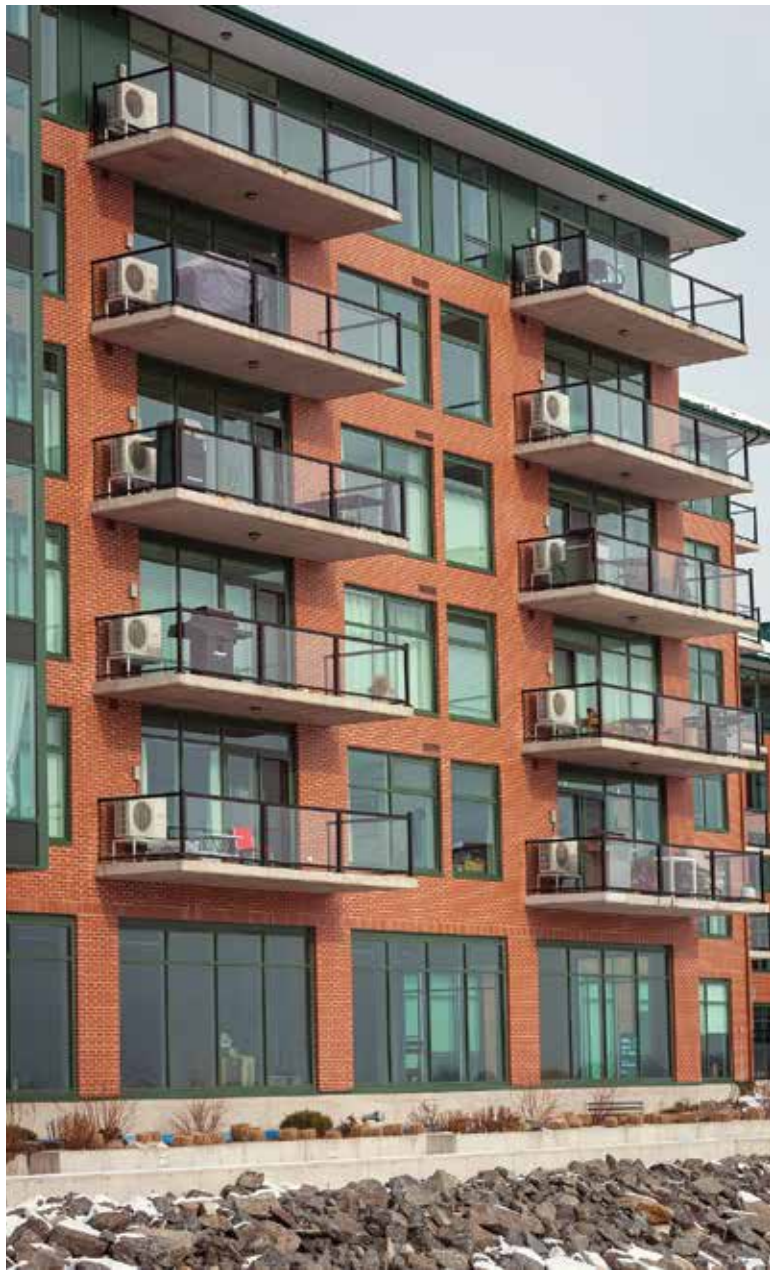
The project includes a total of 79 Fujitsu RLXFZ units for the condo units and one common area.