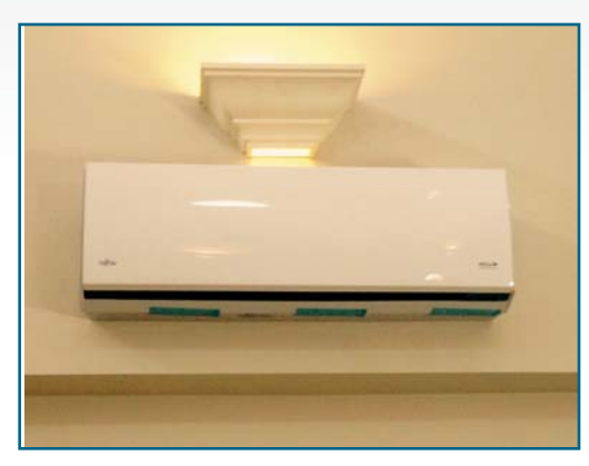
Above is a wall mounted ASU15RLS2 indoor model shown in a common area.

Benoist Brothers contacted the Fujitsu rep. and he agreed to look at the job.