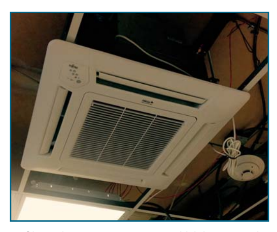
Shown is a compact cassette which is recessed into the ceiling, showing only the grille.

Together, they all met with City Hall officials and explained their ideas, and how they'd go about solving the task at hand. By using mini-splits, there would be no ductwork in the attic. Every office would be zoned, and equipped with its own thermostat. After explaining how the equipment would operate, and how the efficiency would save on energy cost, the Fujitsu rep. designed the system layout, and the City Council accepted the bid proposal.