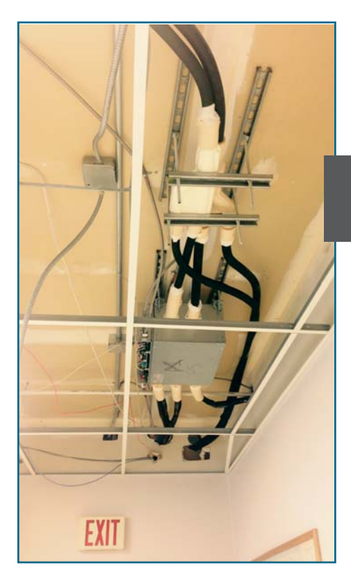
Above: A branch box is required as part of Fujitsu's Hybrid Flex Inverter (HFI) system AOU48RLXFZ1 which can connect from 2 to 8 indoor units.

By using Fujitsu mini splits, the contractors were able to stay out of the attic. All piping and equipment was installed between the suspended ceiling, where easily accessed for service and maintenance. To the delight of city employees, each office was able to set their own temperatures. All units were started on approximately November 23, 2014. In the first month of heating, the city records showed, they saved an approximate $200. The units are so quiet, the employees don't even know they are running. Almost all electric heaters under desks, have been unplugged.